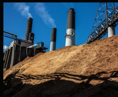
PAPER & PULP