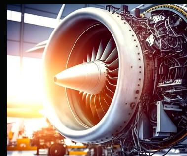
AEROSPACE & AVIATION