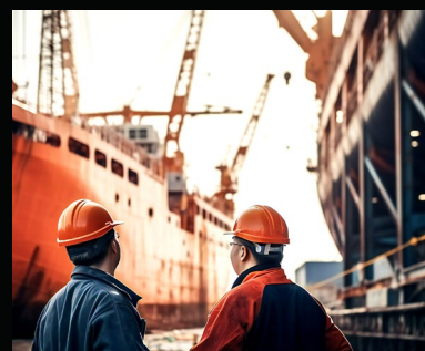
MARINE & OFFSHORE